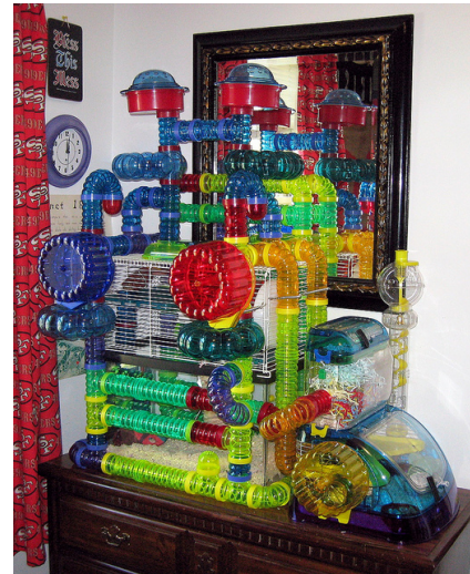
Figure 1:

Print the time it takes for Harry to reach his bed, or the string infinity if Harry is doomed to roam the tubes forever.