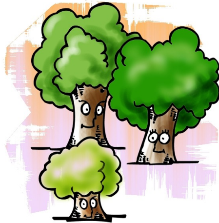
A family of trees.

Before actually sticking the pictures on the paper, you need to figure out how much paper you need. Environmentally aware as you are, you try to minimize the amount of paper needed. You decide to allow pictures within the same level to move to the left or right if this makes the tree less wide (see also the examples below).